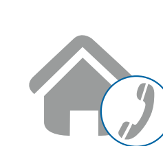
IN HOME LANDLINE

Choose the LifeNet system that works best for you.