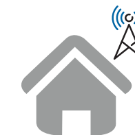
IN HOME CELLULAR